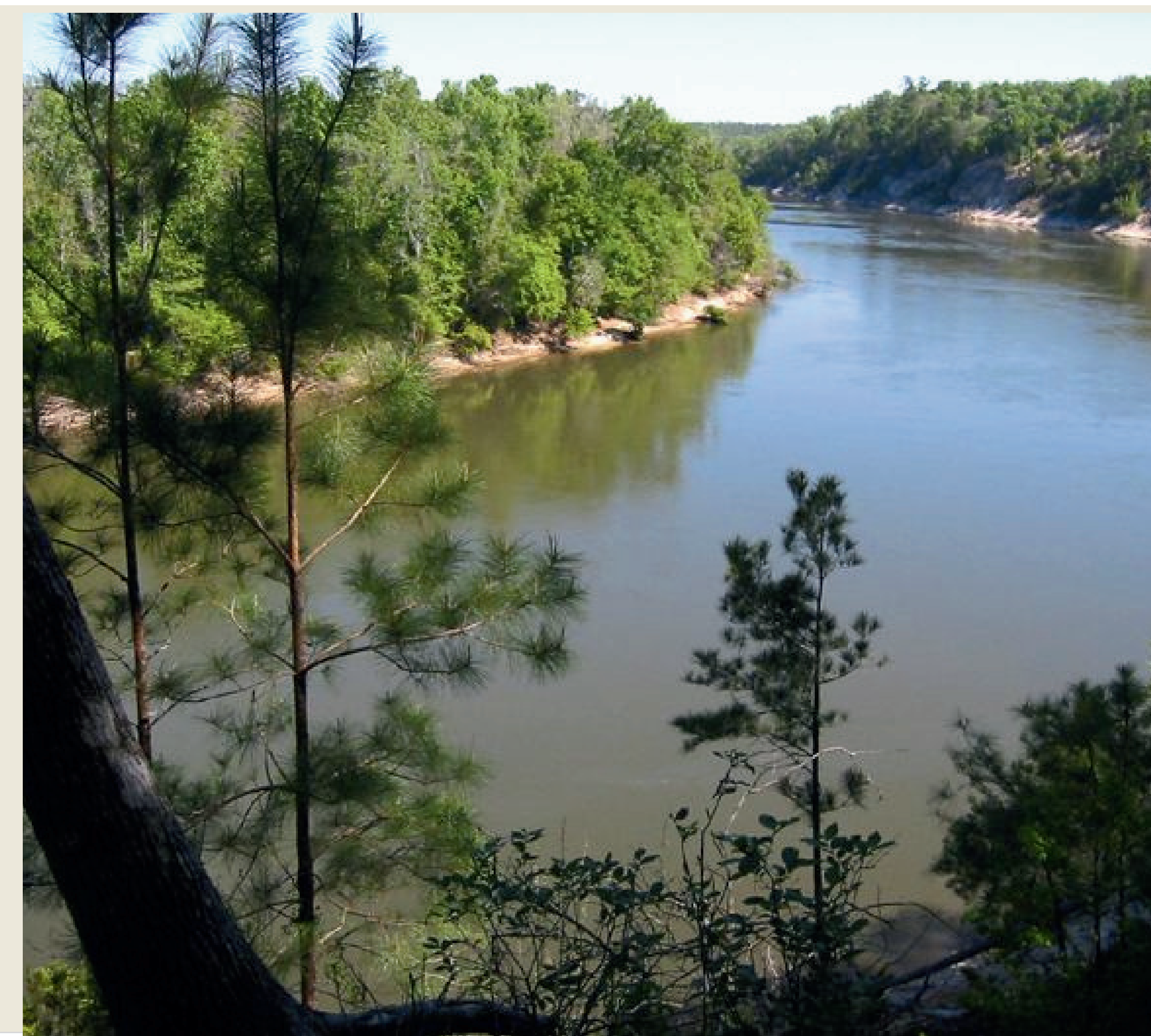
Apalachicola River, Florida